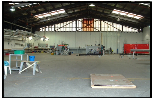
Above: Northland Spars and Rigging's new premises.

"Northland Spars and Rigging are very pleased with the new 800 m2 facility and we will hire additional welders and fitters for the project, providing much needed skilled employment to the Bay of Islands area."