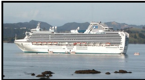
Above: A Cruise Ship in the Bay of Islands.

We have a lot to look forward to in the coming months regarding events happening in the Far North area, due to the Rugby World Cup 2011.