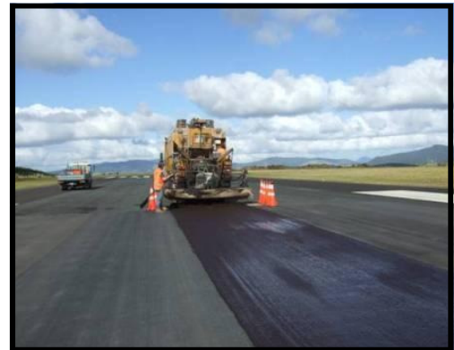
Above: Slurry seal being laid on the runway in Kaitaia.

The work done at the Kaitaia Airport was completed by Fulton Hogan over a three day period in between scheduled flights so as not to disrupt or inconvenience travellers to and from the Airport.