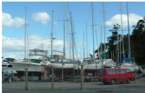
ASHBY'S HARDSTAND AREA

Last year the yard had it's busiest year ever with over 849 boats being hauled out. This was up 24% on the prior year!